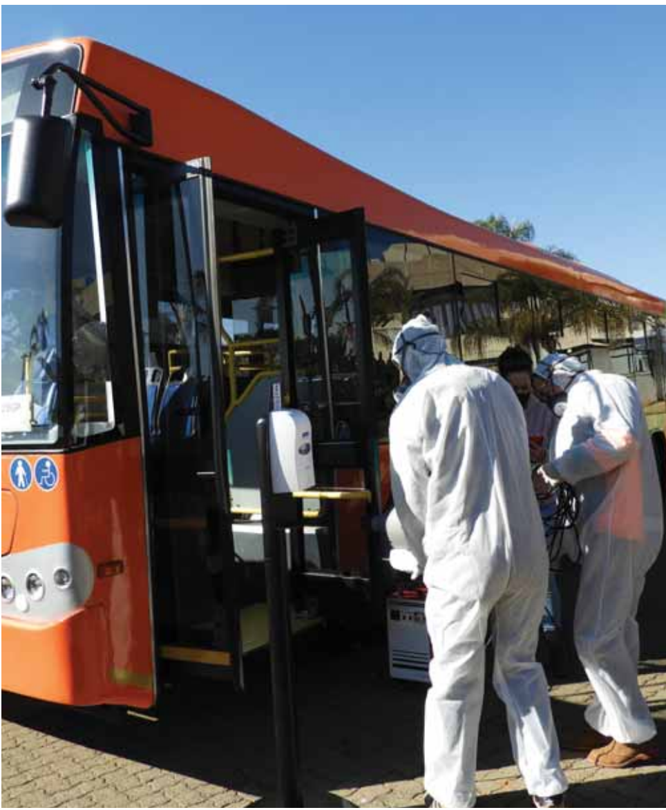
The bus was thoroughly sanitised before the ride.